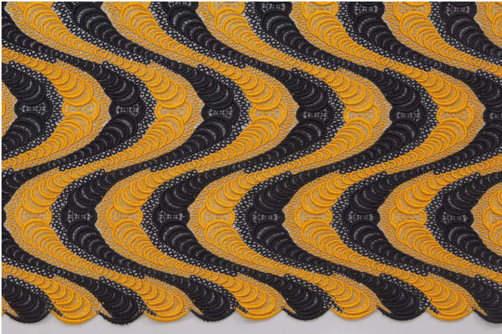
Museum für Völkerkunde Wien, Inv.No. 187.358. KHM mit MVK und ÖTM.