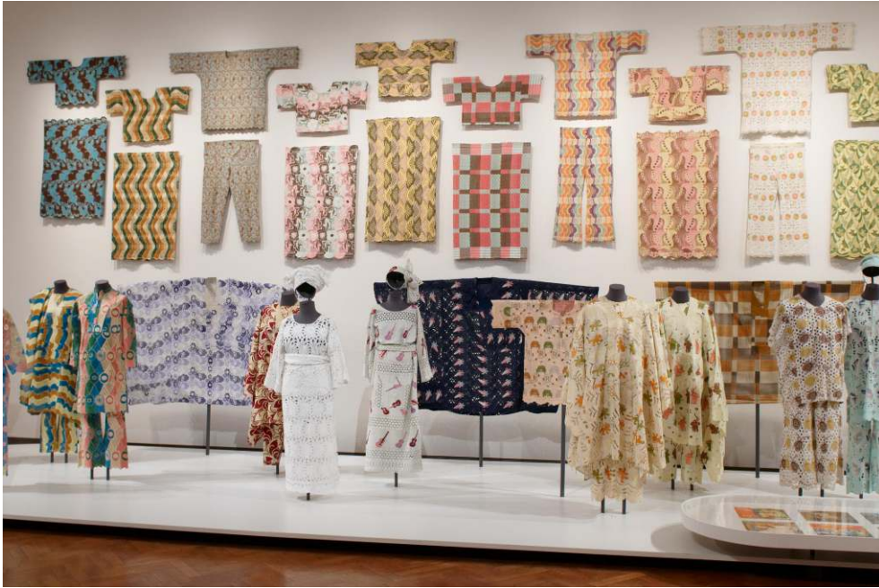
October 2010. Photo : Alex Rosoli. KHM mit MVK und ÖTM.

View of exhibition installation at the Museum für Völkerkunde Wien