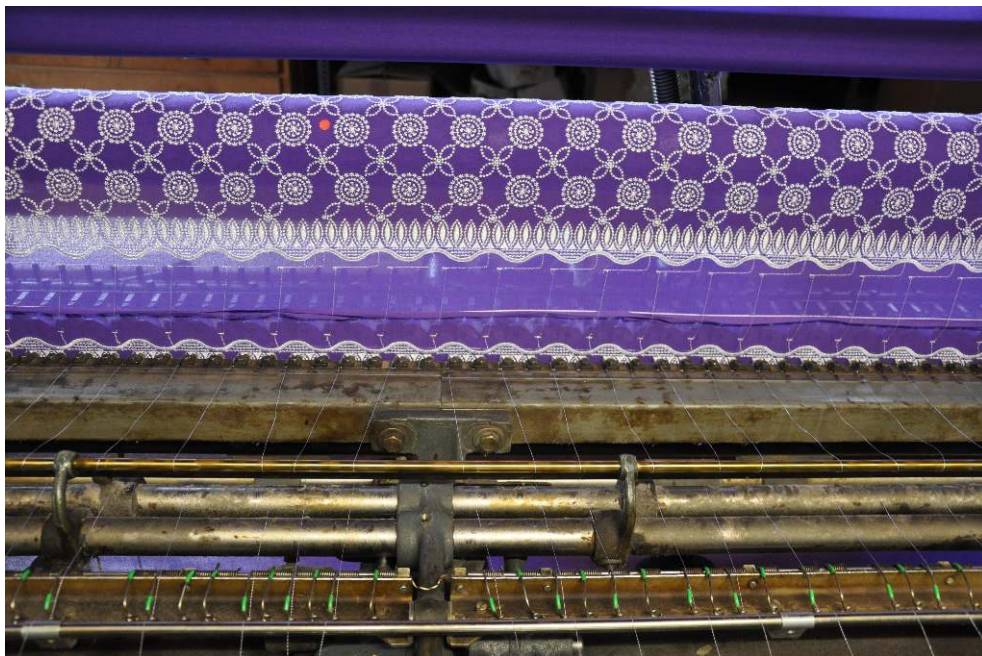
A red spot marks faults, which are then corrected on the hand embroidery machine. Ernst Bösch company, Lustenau. Photo: Barbara Plankensteiner 2010.

Close-up of a fabric with allover embroidery emerging from an old-fashioned embroidery machine still in use