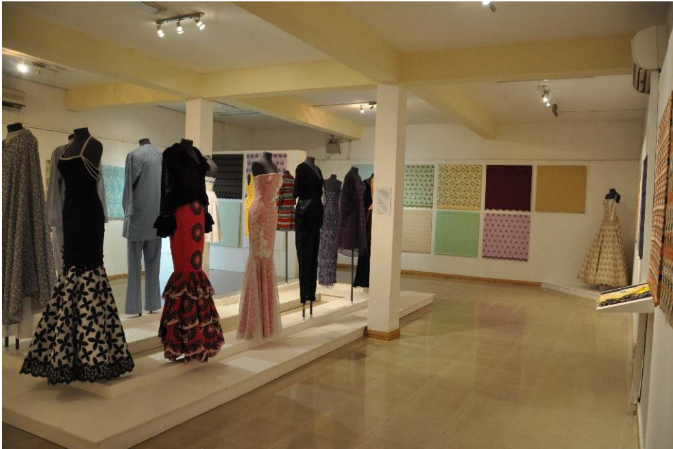
June 2011.