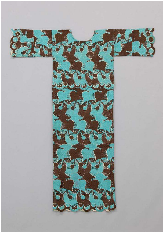
NIGERIA MID-1979s, MUSEUM FÜR VÖLKERKUNDE INV.NO. 188.510.