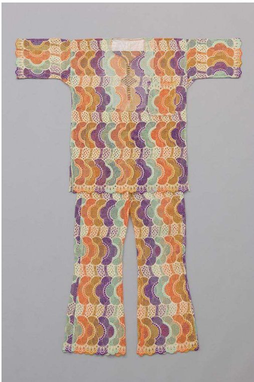
early 1970s. Cotton fabric with industrial eyelet embroidery, Buba shirt: L. 78.5 cm, sokoto pants: L. 107 cm Museum für Völkerkunde Wien, Inv. No. 187.530.