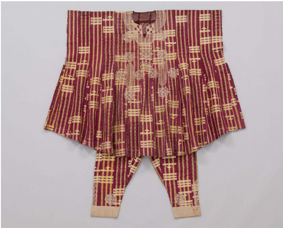
Southwestern Nigeria, late 1970s. Handwoven narrow-strip cloth in cotton and lurex yarn. Dansiki shirt: L 103 cm, kembe three-quarter length pants: L: 96 cm. Museum für Völkerkunde Wien, Inv. No. 188.522.