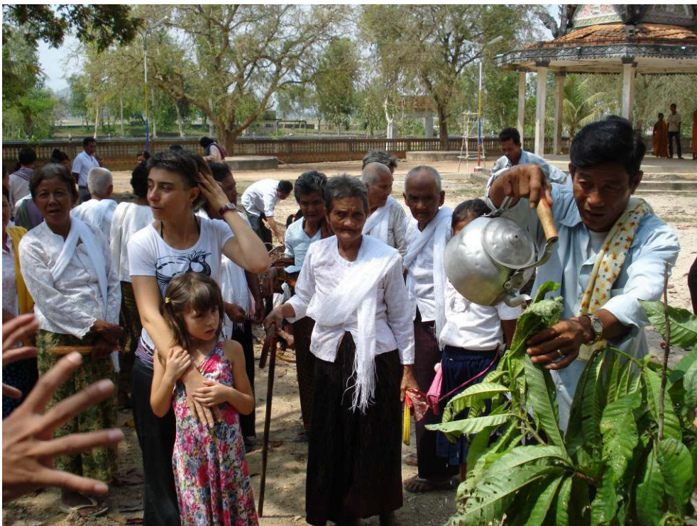
Planting the bodhi trees Photos by Judith Strasser (2012)