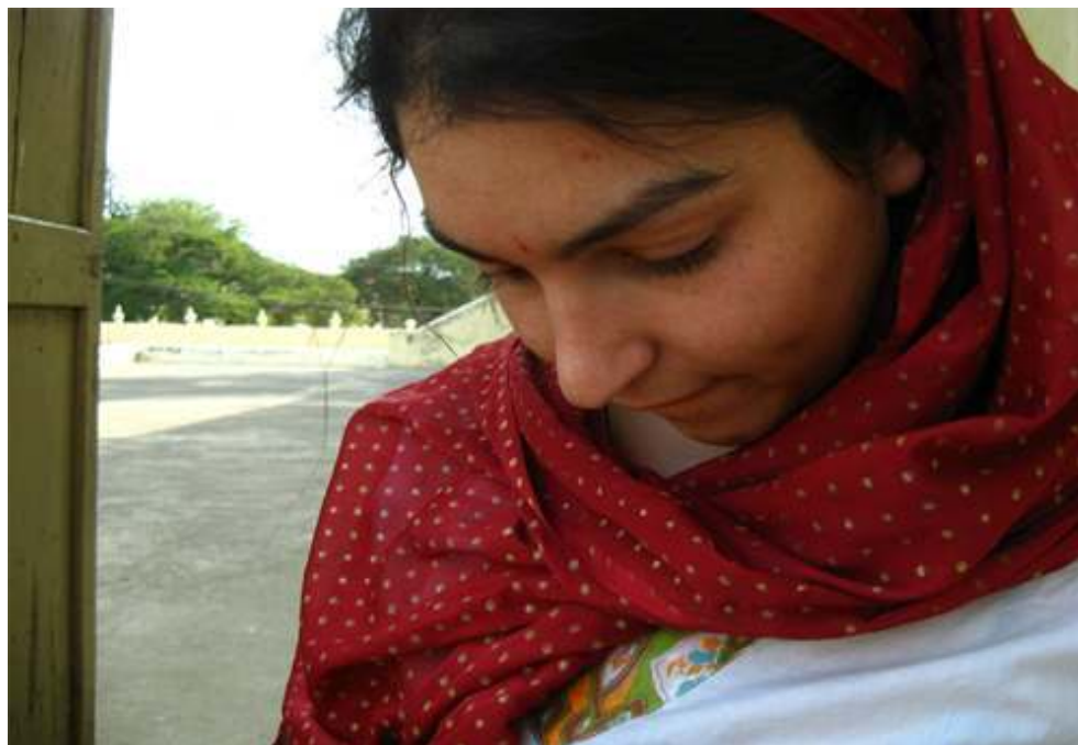
December 2007