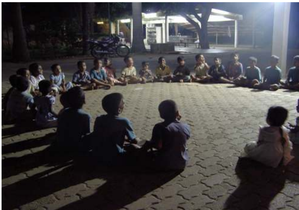
August 2006.